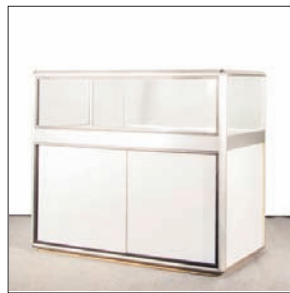
SYMA desk showcase EUR 50.00 Code 025.010.150.080 (100x50x70 cm)