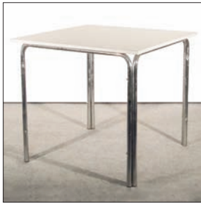
Viena table EUR 25.00 Code 025.010.020.010 (80x80x70 cm)