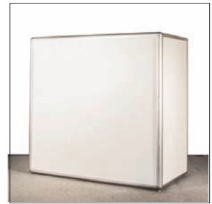
Information desk EUR 43.00 Code 024.000.140.080 (90x40x80 cm)