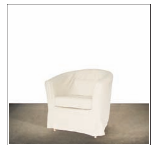
Armchair with cover EUR 35.00 Code 025.010.010.020 (80x70x80 cm)