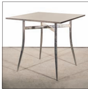
Total Mob table EUR 25.00 Code 025.010.020.083 (80x80x73 cm)