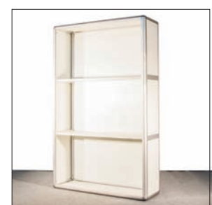
Shelves rack EUR 43.00 Code 024.000.140.070 (94x29x150 cm)