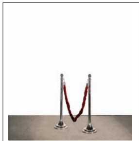
Area delimitation support EUR 18.00 Code 025.010.120.130 (49 cm) Cord for delimitation support EUR 8.00 Code 025.010.120.140