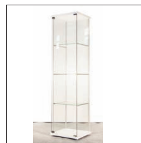
Showcase glass door EUR.65 Code 025.010.200.035 - white (45x35x164 cm)