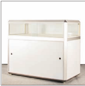
SMADO showcase desk EUR 50.00 Code 025.010.160.040 (100x50x70 cm)