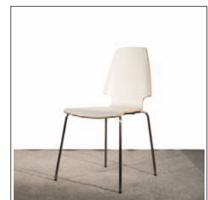
White veneer chair EUR 14.00 steel frame Code 025.010.040.050