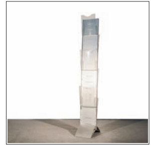
Display support vertical EUR 49.00 Code 025.010.150.041