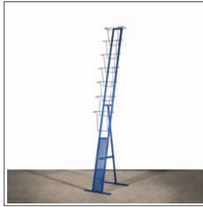
Brochures expo stender EUR 49.00 Code 025.010.150.042