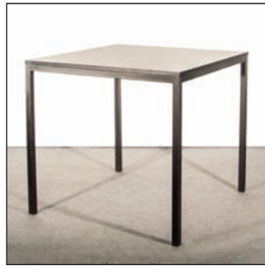
Germania table EUR 25.00 Code 025.010.020.080 (80x80x72 cm)