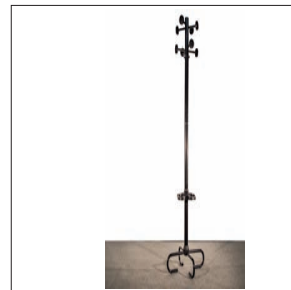
Prisma clothes hanger (black) EUR 14.00 Code 025.010.060.050