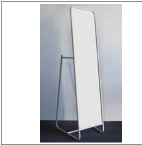
Mirror EUR 24.00 Code 025.010.120.180 (48x160 cm)