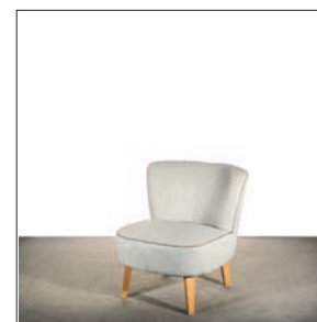
Jim armchair - gray EUR:60 Code: 025.010.010.060 (60x60x75 cm)