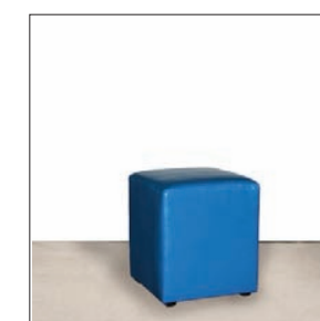
Blue stool EUR 11.00 Code: 025.010.040.024