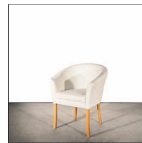
Cafe armchair, white EUR 40.00 Code 025.010.010.025 (70x70x80 cm)