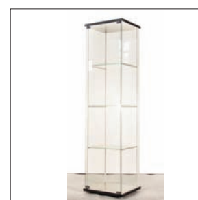
Showcase glass door EUR 65.00 Code: 025.010.200.036 - black (45x35x64 cm)