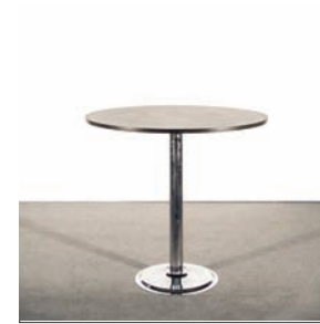
Total Mob table EUR 25.00 Code 025.010.030.045 (80 cm diameter; H: 73 cm)