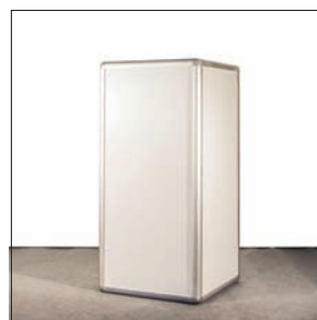
Display high parallelepiped EUR 24.00 Code 024.000.140.020 (50x50x100 cm)