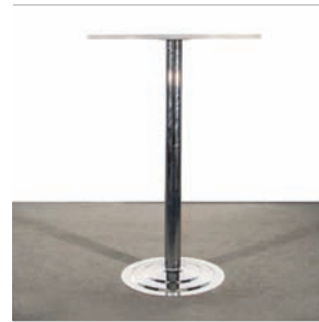
Total Mob table tall, snack-bar EUR 25.00 Code 025.010.030.044 (80 cm diameter; H: 110 cm)