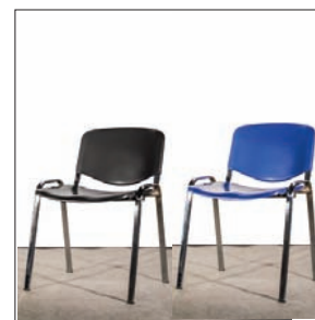
Leda chair (nickeled) EUR 14.00 Code 025.010.040.040 - black Code 025.010.040.120 - blue