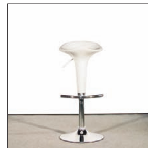
Vida ABS bar stool-white EUR 15.00 Code: 025.010.040.170 (38x36x 66-87 cm)