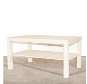
Coffee table 90/55 white EUR 15.00 Code 025.010.020.196 (90x55x45 cm)