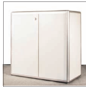
CUPBOARD EUR 43.00 Code 024.000.140.040 (100x50x70 cm)