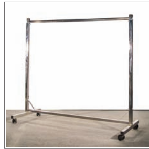
Exhibiting stender EUR 29.00 Code 025.010.120.160