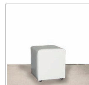
White stool EUR 11.00 Code: 025.010.040.025