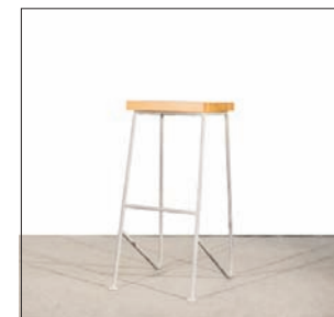
Domicilio stool wooden seat EUR 29.00 Code 025.010.040.140 (36x34.5x75 cm)