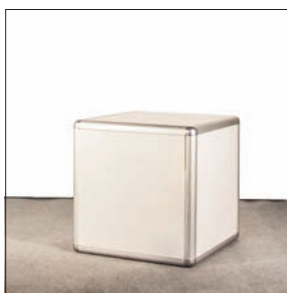
Display cube EUR 21.00 Code 024.000.140.010 (50x50x50 cm)