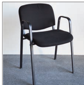
Rio CN Maxi chair EUR 14.00 Code 025.010.040.032