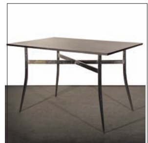
Total Mob table (black) EUR 25.00 Code 025.010.020.021 (120x80x73 cm)