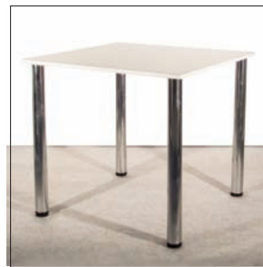
Milano table EUR 25.00 Code 025.010.020.090 (80x80x72 cm)