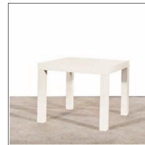
Coffee table 55/55 Code EUR 25.00 Code 025.010.030.050 (55x55x45 cm)