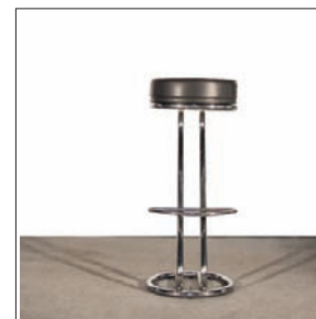
Black bar stool EUR 14.00 Code 025.010.040.080