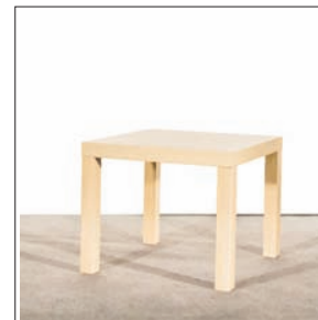
Coffee table 55/55 birch effect EUR 25.00 Code 025.010.030.055 (55x55x45 cm)