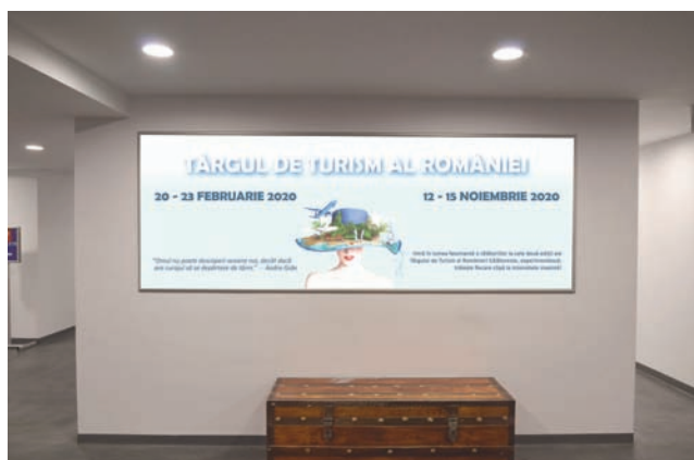
SNAP FRAME, SIZE 320X110 CM