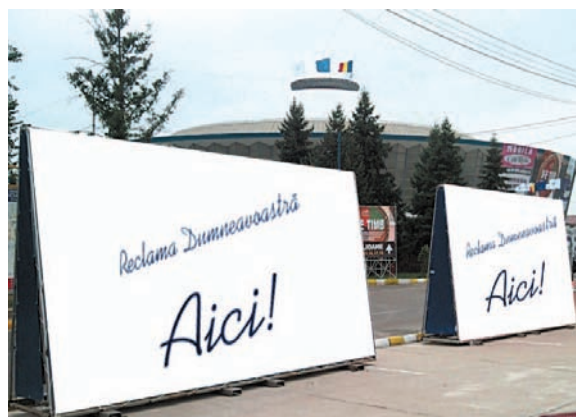
BANNER DISPLAY ON MOBILE PLATFORMS