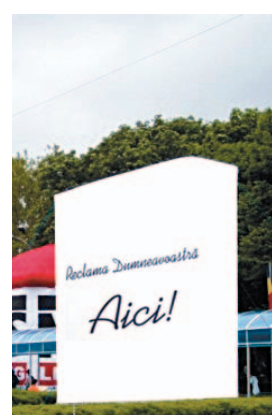
ADVERTISING MASCOTS DISPLAY