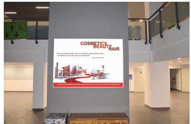
SNAP FRAME, SIZE 200X140 CM