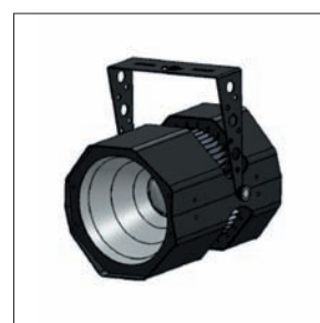
Reflector LED VIRGO 40W 4350 LM 4100 K EUR 40.00 Cod 019.010.200.045