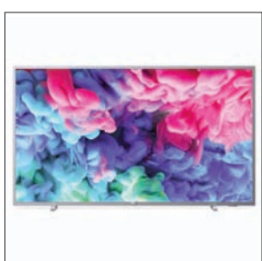
TV LED SMART 4K, UHD ultrasubtire (diagonala ecran: 126 cm) Cod 025 010 130 045