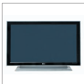
TV Plasma (diagonala ecran: 107 cm) Cod 025 010 130 040