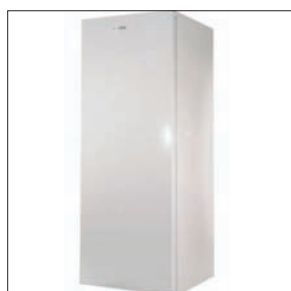
Frigider ARCTIC 255 l Cod 025 010 020 199