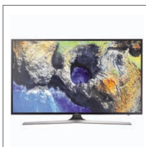
TV SAMSUNG UHD, (diagonala ecran: 163 cm) Cod 025 010 130 047