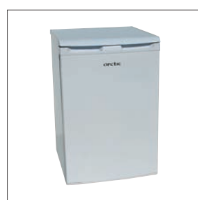
Racitor (140 l) Cod 025 010 070 010 (55 x 61 x 84 cm)