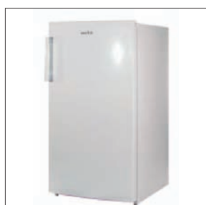
Frigider ARCTIC FB 155 Cod 025 010 020 198