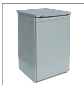
Frigider ARCTIC (180 l) Cod 025 010 070 020